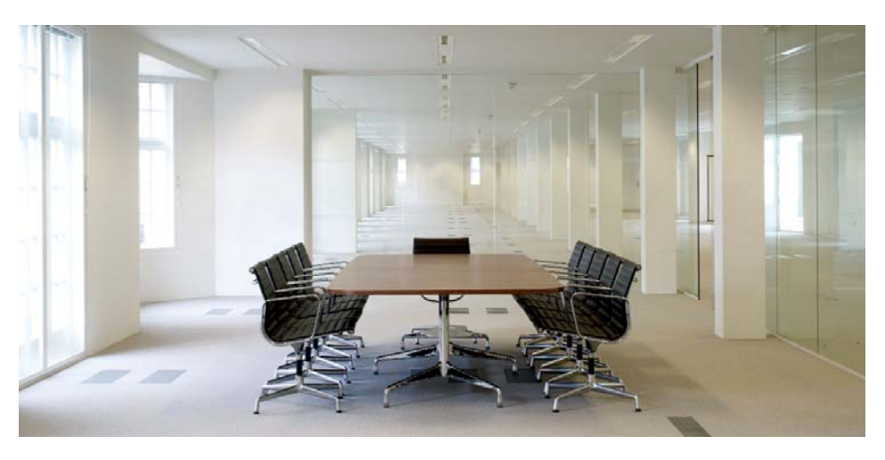
by selling half of this...